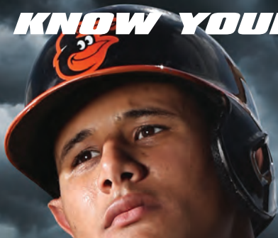
MANNY MACHADO S100PC