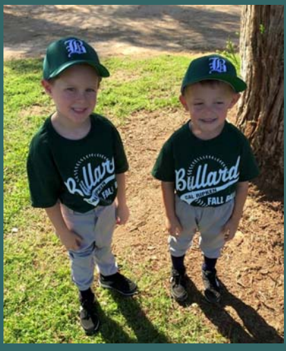
Two young players from the Bullard (CA) Cal Ripken League have fun participating in a great day of Fall Ball.