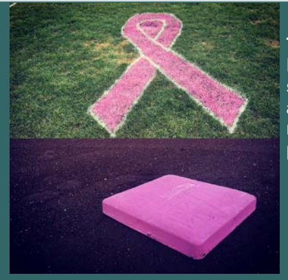
The Mid-Island Babe Ruth League (NY) spreads breast cancer awareness during the month of October by painting their field pink.