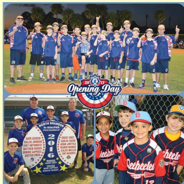
Opening Days Galore in Florida—Pictured above are the North Brandon and Okeeheelee, Florida Babe Ruth Leagues. Okeeheelee is the defending champion of the 2016 Cal Ripken Major/60 World Series.