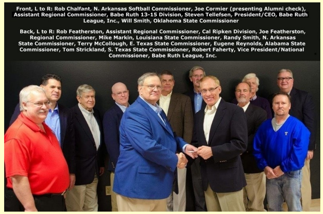
Presentation of Alumni Check

Players from the 2005 PNW Regional 12U Champions (Port Angeles, Washington) visit the National Constitution Center and Liberty Bell in Philadelphia with their host family. The World Series was hosted by Cherry Hill, New Jersey, located just 10 minutes east.