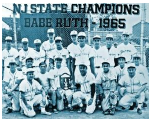
Fairview, New Jersey 1965 Babe Ruth State Champs in 1965 and in 2015 . Pictured left are the state title holders displaying their championship plaque.