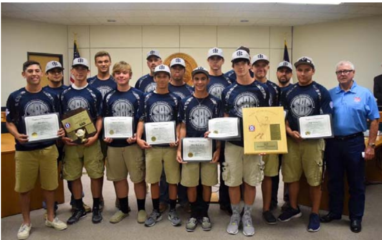
The City of Lake Jackson, TX paid tribute to players from the South Brazoria Babe Ruth League. The Mayor presented each player with a Certificate of Commendation.