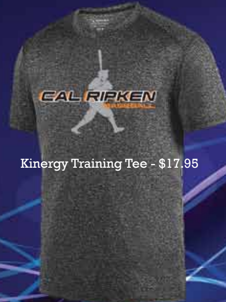
Kinergy Training Tee - $17.95