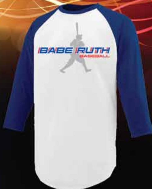
3/4 Sleeve Jersey - $17.95