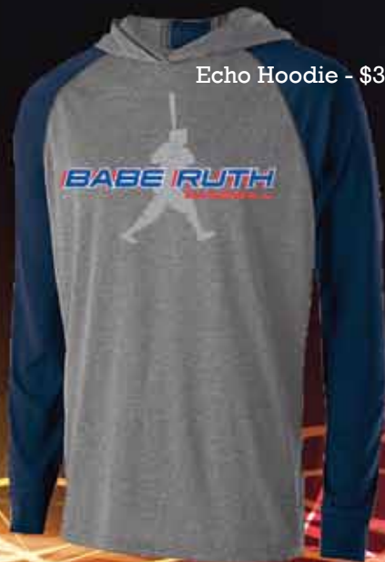
Echo Hoodie - $34.95

... when purchasing during Charter process!