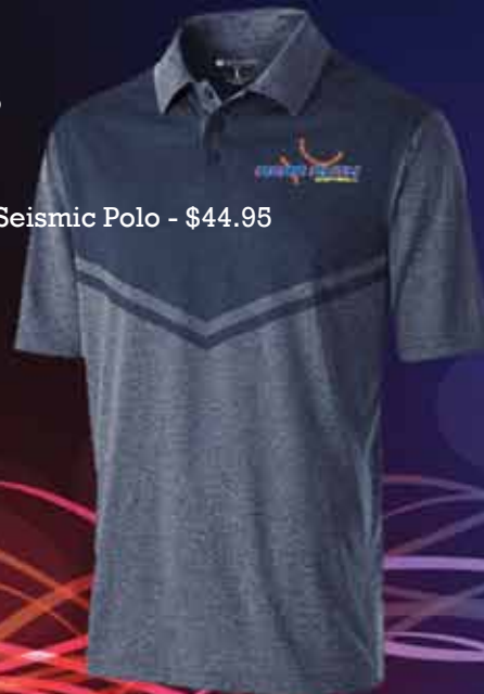
Seismic Polo - $44.95