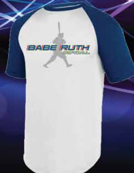
Short Sleeve Jersey - $15.95

See these plus other great items when you shop the Babe Ruth Store!