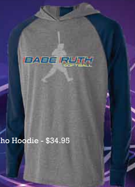
Echo Hoodie - $34.95