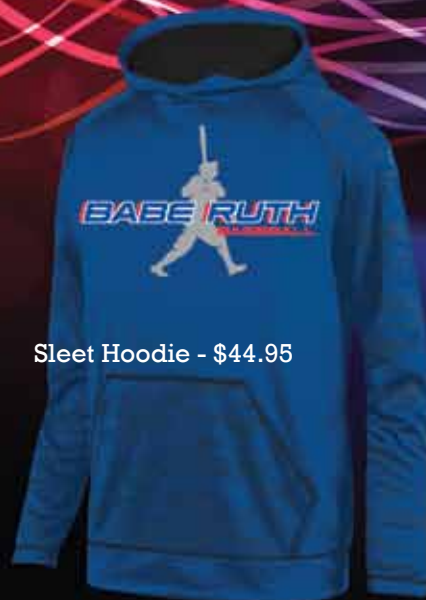
Sleet Hoodie - $44.95