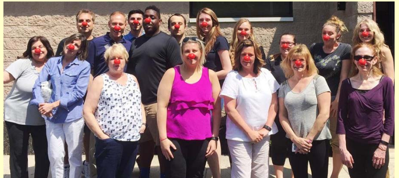
Babe Ruth Headquarters Staff Supports Red Nose Day