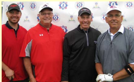
BRL Golf Outing Happy Foursome