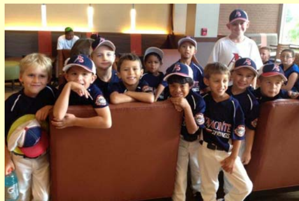
Smiles all across the board from the participants in the Altamonte Springs Babe Ruth League.